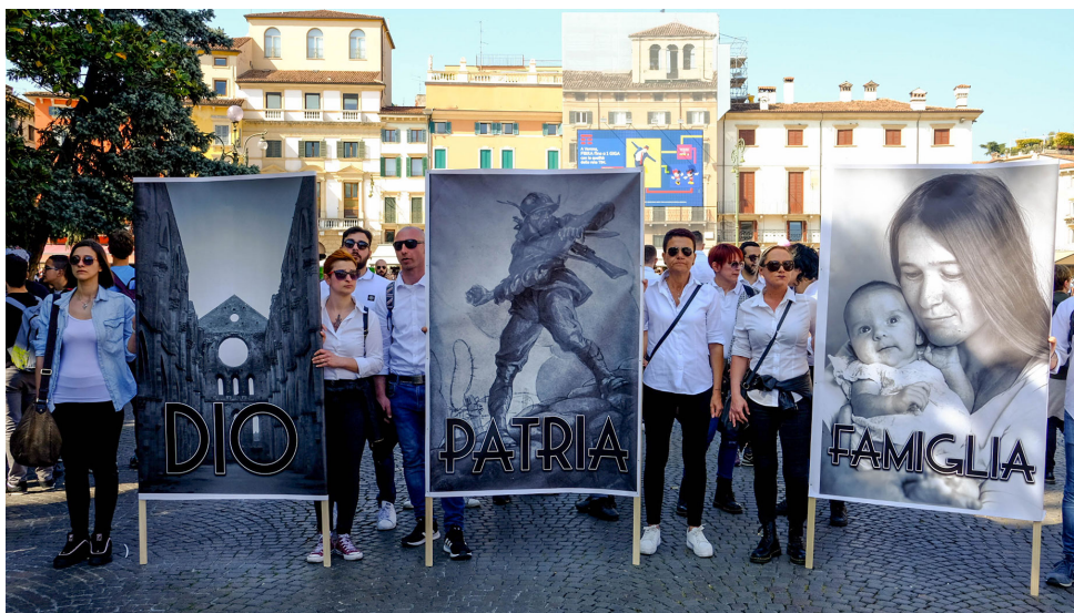
Anti-abortion activists carry placards that read: "God," "Homeland" and "Family," at a "pro-family" rally in Verona in March.

That shift is on full display in Verona, a city some 500 kilometers (310 miles) north of the capital that has become a laboratory for the anti-abortion movement.