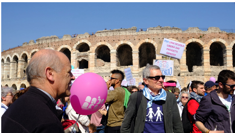
Demonstrators gather at a “pro-family” rally in Verona, outside of the controversial WCF forum, where Salvini was speaking, in March.